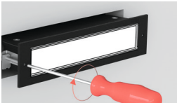
Fully enclosed luminaire with installation housing ensures seamless integration and weathertight operation.