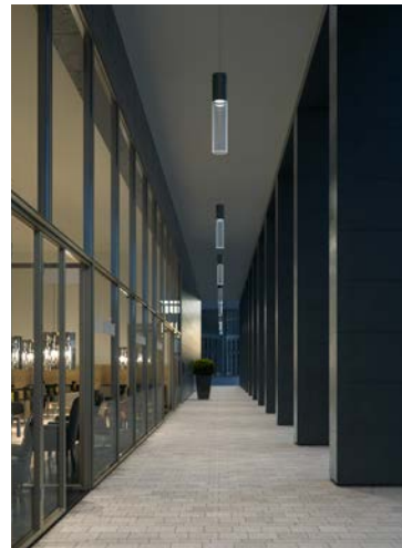
For pendant luminaires, see Page 76.