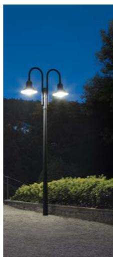
Available in twin configuration as custom product.

NRTL listed to North American standards · Suitable for wet locations · Protection class IP 65