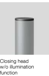
Closing head w/o illumination function