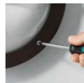
Access with a tool